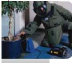
Bomb squad technician sets up RTR-4 to acquire image of suspicious object in a typical office lobby.

The standard RTR-4 system consists of a notebook computer Control Unit, a choice of pulsed X-ray Sources, and an X-ray Imager. A complete system is contained in a single weatherproof, lightweight container for maximum field mobility. The RTR-4 can be operated from an internal battery, external DC power, or AC line voltage. The system can be set up quickly and easily by one person, with no tools required.