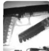
Image of gun found in suspect package.