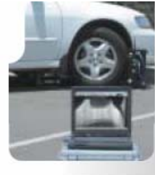
RTR-4 set up for inspection of car tire.

The RTR-4 ® – designed with over 30 years of SAIC engineering experience and expertise – is the latest and still the only fully digital, portable X-ray equipment available to Explosive Ordnance Disposal (EOD), security and law enforcement professionals. The patented RTR-4 has proven itself to be the world's most popular X-ray system for EOD applications. It has been selected as the system of choice by the U.S. military and other key law enforcement organizations. Around the world, the RTR-4 is also setting the standard as a tool for professional bomb disposal teams. It has achieved this distinction by providing state-of-the-art features and capabilities in a practical, field-deployable instrument. Consistently, the RTR-4 is enhancing the safety margin for EOD technicians and innocent civilians. The RTR-4's compact and portable design enables it to be set-up in a matter of minutes, when time is of the essence for threat response. Operators can utilize the RTR-4 with the confidence that operator safety has been significantly enhanced.