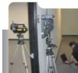
RTR-4 can be used for wall inspections.