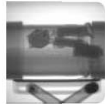
Image of bomb inside 8 mm thick steel pipe.