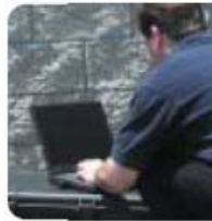
Technician acquiring image of suspicious object from a safe distance.