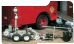
RTR-4 with the Wireless Option shown mounted on robot.