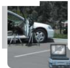
RTR-4 has been successfully used to inspect suspicious vehicles at border crossing locations.